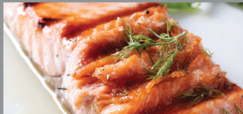
Kulbasti Salmon Fish 940 ₪

Grilled fish with seasonal greens cooked on a charcoal grill.