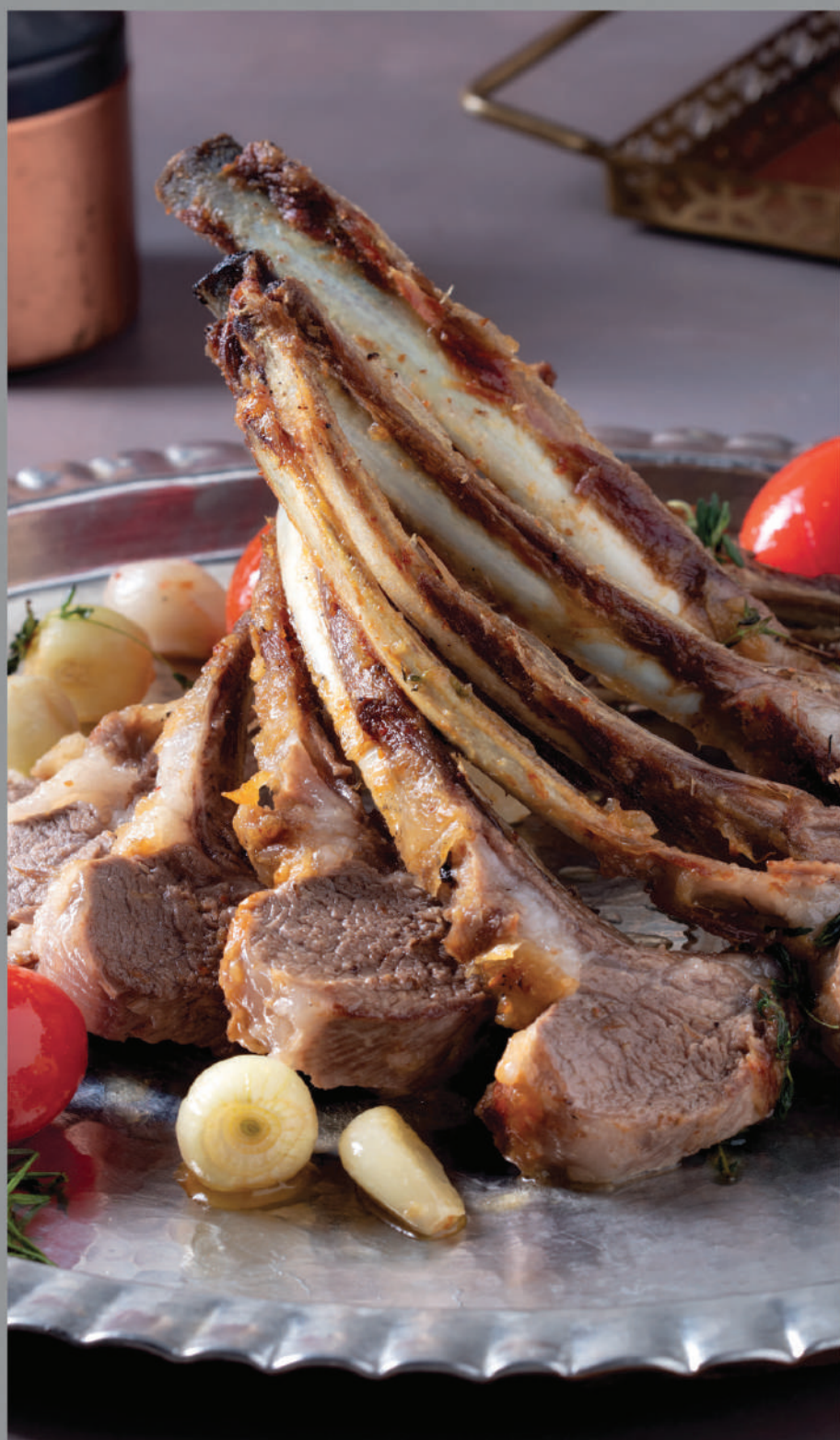
Rack of Lamb (for two pax) 5.100 ₺

Baked lamb meat prepared from the rib region of the lamb