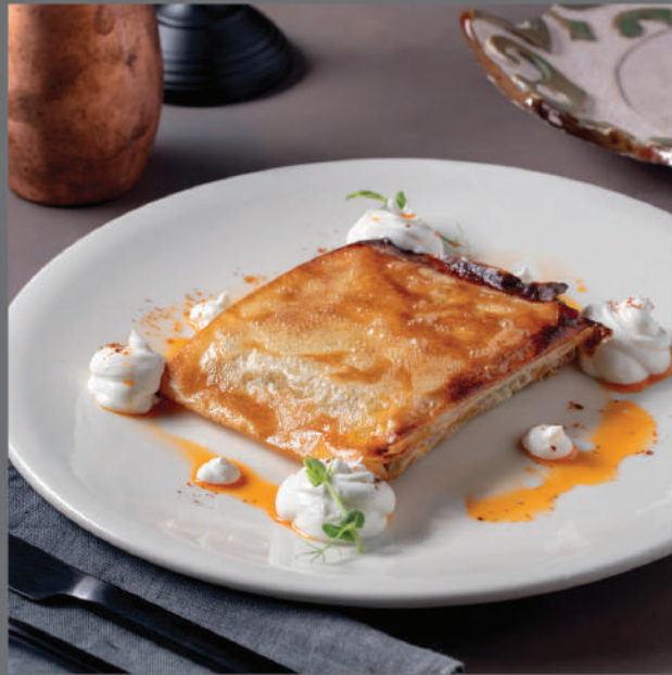
Vegetable Katmer (Vegetarian) 620 ₺ Hidden inside crispy phyllo dough, crepes made with eggs and flour, accompanied by seasonal vegetables. Served with garlic yogurt.