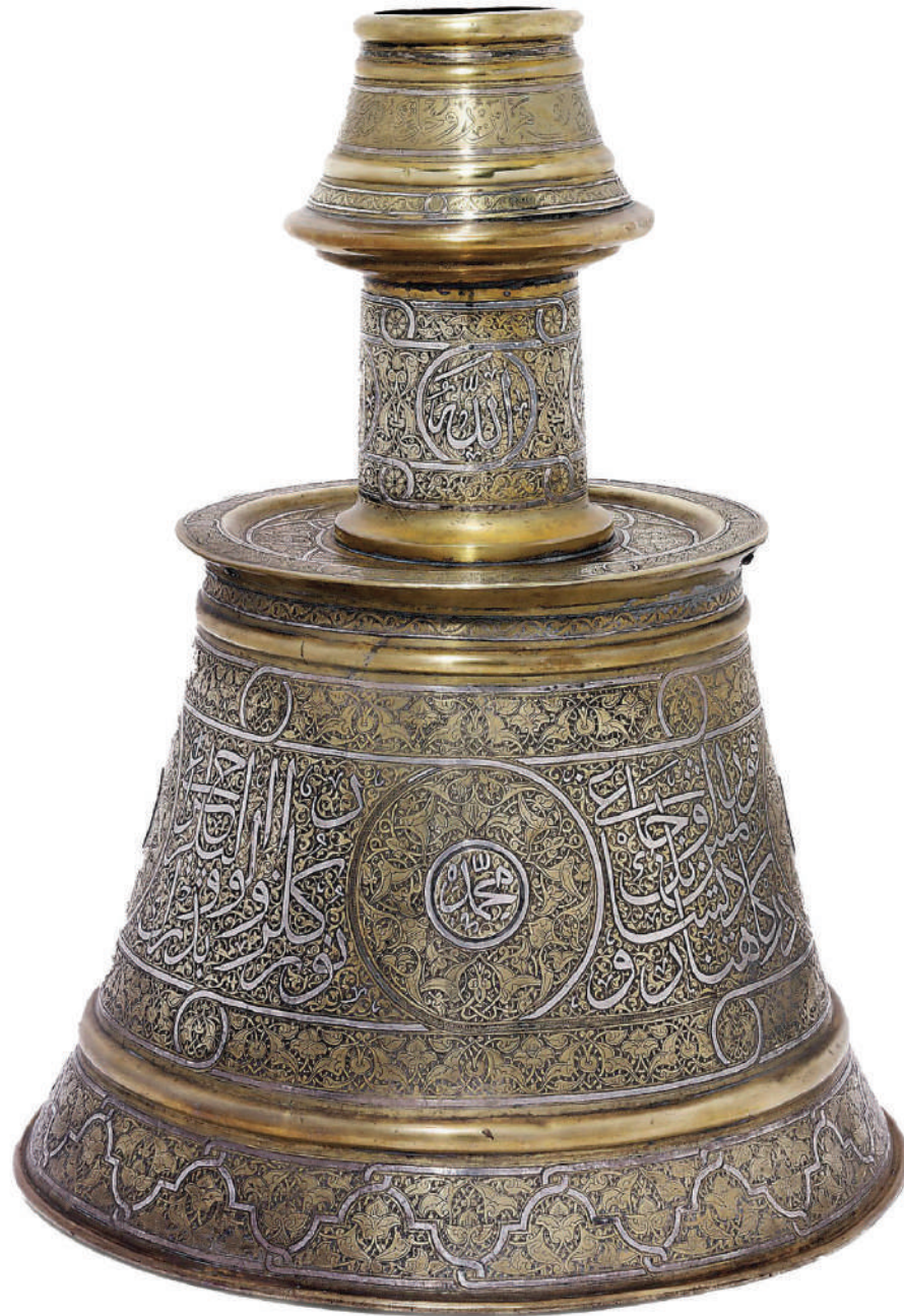
A MONUMENTAL MAMLUK STYLE SILVER-INLAID BRASS CANDLESTICK OTTOMAN TURKEY, DATED MUHARRAM AH 1340/APRIL-MAY 1921-22 AD

Of typical form, the body with a large thuluth inscription in Turkish on two lines bordered by silver lines interlocking to form four dividing roundels, the dense engraved decoration with palmette scrolls organised in various bands and medallions, the neck with the name of God repeated four times, the mouth with an engraved Turkish inscription in thuluth, the top part separating to reveal a storage space, good condition 24in. (61cm.) high