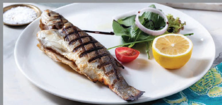
Grilled Sea Bass 930 ₪

Mastic, coriander, lemon, dill, vegetable and almond.