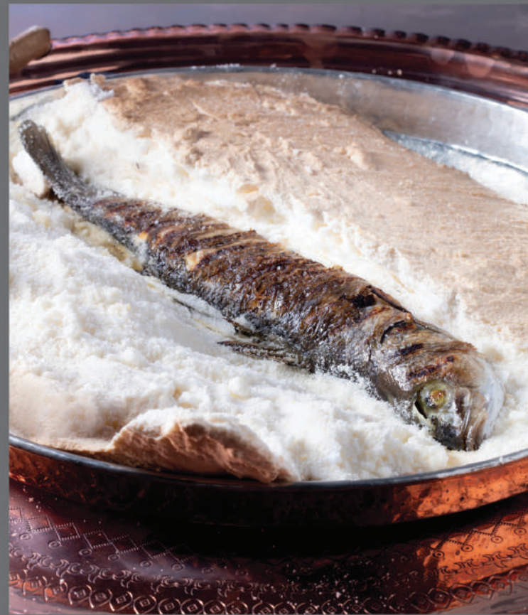
Sea Bass or Sea Bream in Salt (for two pax)*** A large sea bass wrapped in a special paper is put in to a thick mixture of salt and eggs and cooked in the oven.