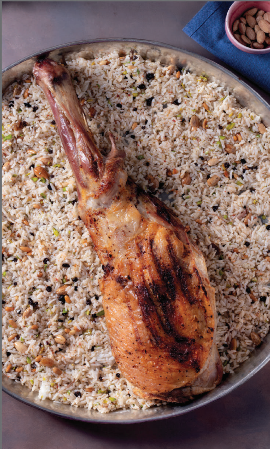
Lamb Shoulder (for two – three pax) 4.980 ₺ Lamb shoulder served with stuffed rice cooked in tandoori. Stuffed pilaf is prepared with rice, currants, black pepper and pine nuts.

***Due to seasonal price changes, any price has not set for the dish. Please before ordering, ask the price to the waiter.