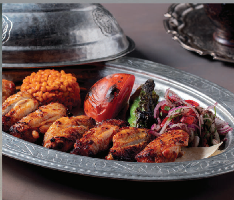
Grilled Chicken Wings 750 ₺ Grilled Chicken Wings Marinated with Pepper Paste, Yogurt and and herbs

Meat is the basic element of Ottoman Food culture. Eating meat was the main requirement of the nutrition in Ottoman Empire and Central Asia. Meat such as sheep, deer, rabbit, horse meat and poultry such as goose, quail and duck were the main meats in the pre-Muslim eating habits of Turks living on hunting and animal husbandry. After our ancestors from Central Asian steppes entered into the Anatolia, meat maintained its leading role in the cuisine and even had a important place as a social status. Cooked with different recipes with the comfort of richness in Ottoman Palaces. In our restaurant, we have prepared recipes staying true to the original as much as possible.