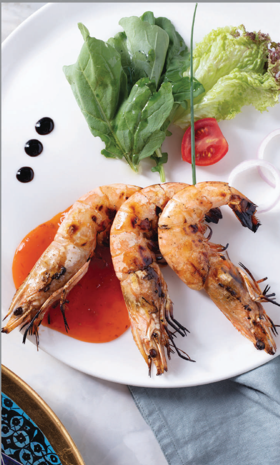
Grilled Jumbo Shrimp 1.800 ₪

Grilled fish with seasonal greens cooked on a charcoal grill.