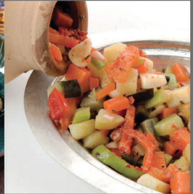
Vegetarian Testi Kebab 620 ₺ Vegetable casserole dish prepared in the traditional cooking method.