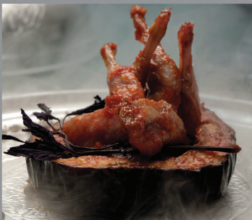
Quail with Basil Sauce 1.100 ₺ Roasted eggplant in the oven quail meat cooked with basil and honey.