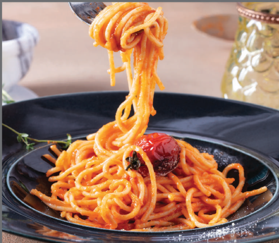
*** Spaghetti 450 ₺ Neapolitan Tomato sauce, basil and parmesan cheese.

***Not from Ottoman cuisine, but added to the menu for families with children.