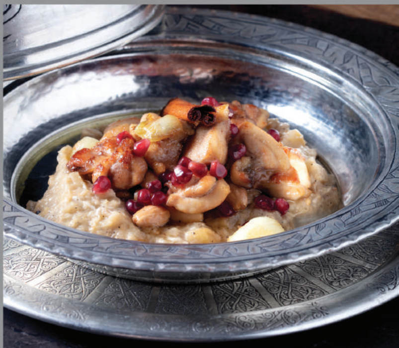
Roasted Chicken with Eggplant puree 760 ₺ Chicken marinated with cinnamon over Eggplant Purée.

A special recipe from Suleiman, the Magnificent's cuisine a recipe from a banquet book of 1539.