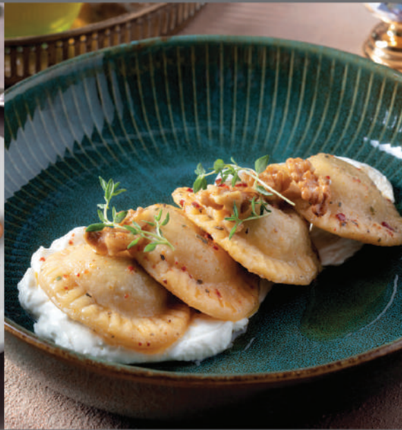
Piruhi (Vegetarian) 420 ₺ Tulum cheese is wrapped in a thin, unleavened dough with onions and parsley. Sprinkle with toasted walnuts with butter.