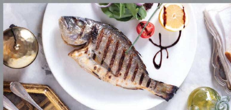
Grilled Sea Bream 930 ₪

Grilled fish with seasonal greens cooked on a charcoal grill