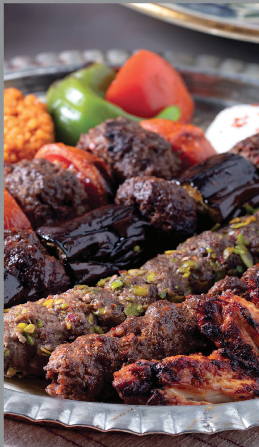
Mixed Grill (for two pax) 4.250 ₺

Baked lamb meat prepared from the rib region of the lamb