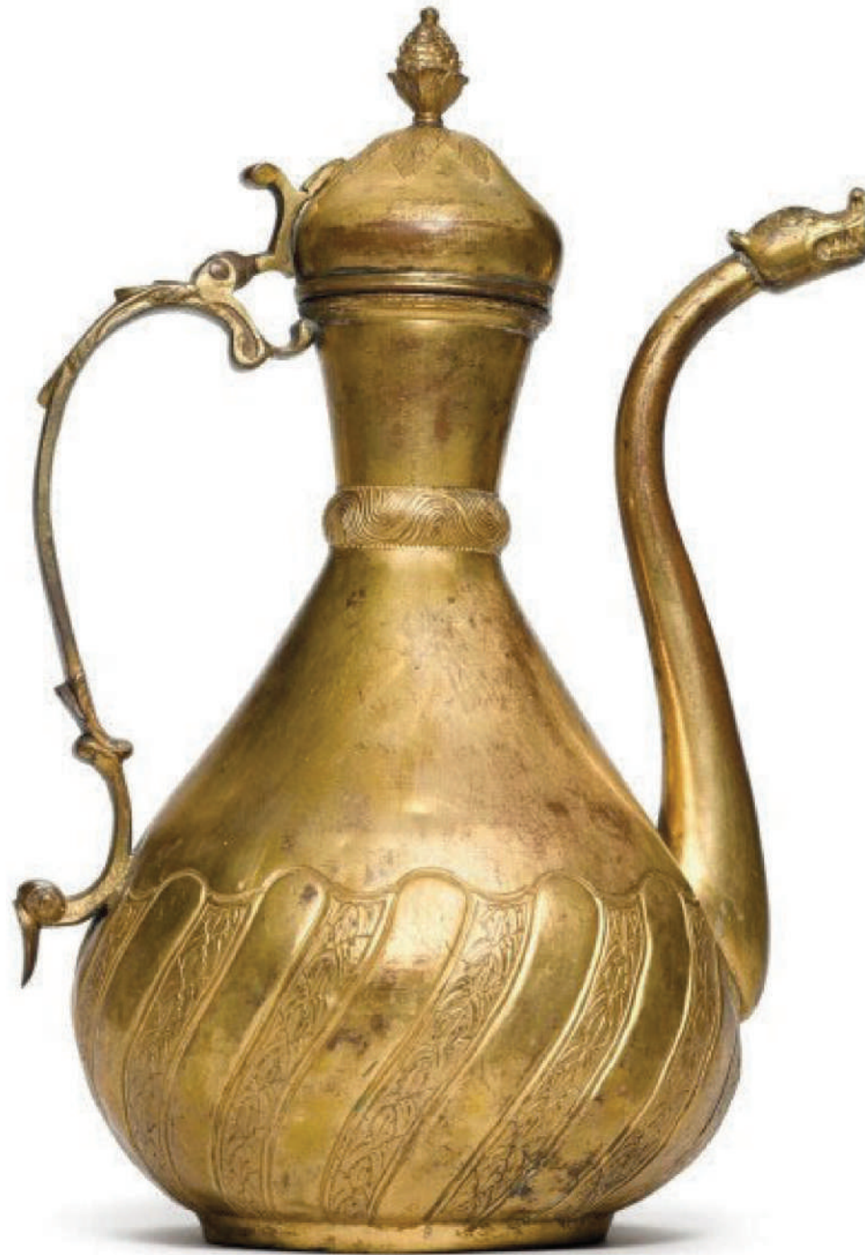
A MONUMENTAL GILT-COPPER (TOMBAK) EWER AND BASIN OTTOMAN TURKEY, LATE 18TH/EARLY 19TH CENTURY