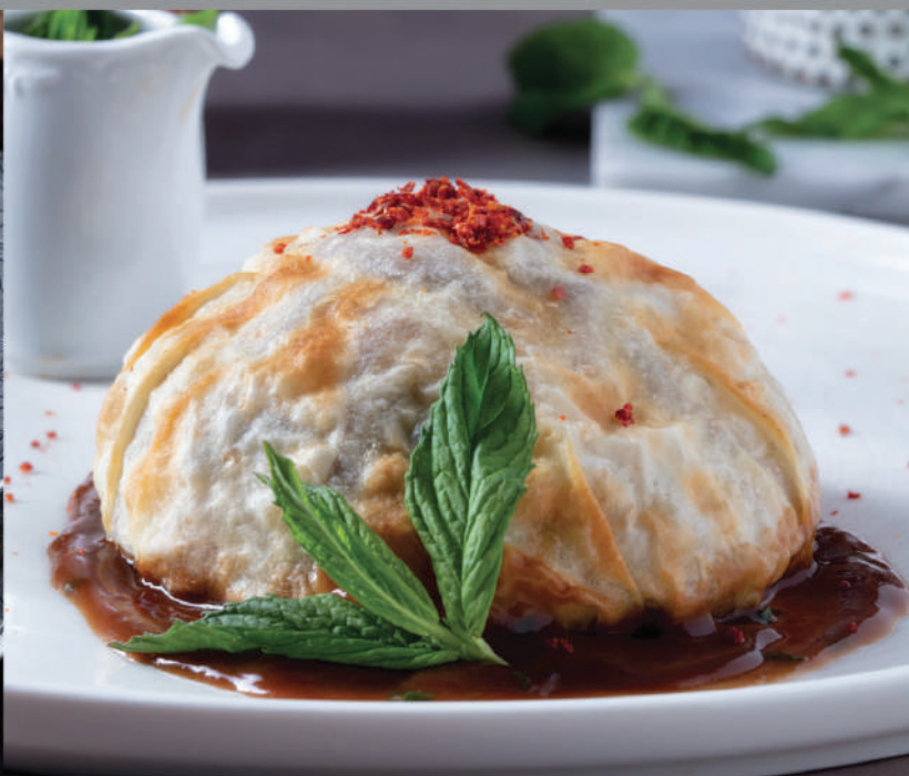
Goose Kebab 1.500 ₺ Goose meat served with rice and special sauce in phyllo pack.