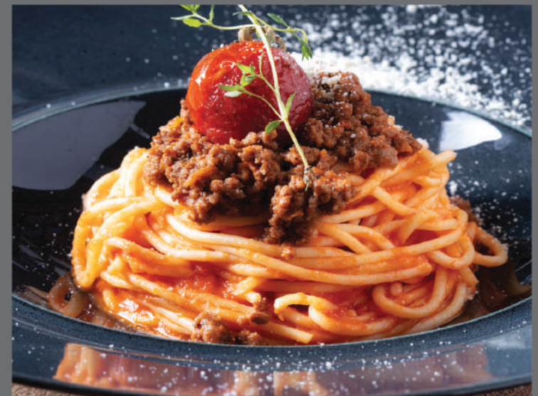
*** Spaghetti Bolognese 500 ₺ Finly chopped minced meat, basil, parmesan cheese.

"Please let us know your dietary requirements and allergies so we can better prepare your meal!" All prices are mentioned in Turkish Lira and include VAT. 10% service fee will be added.