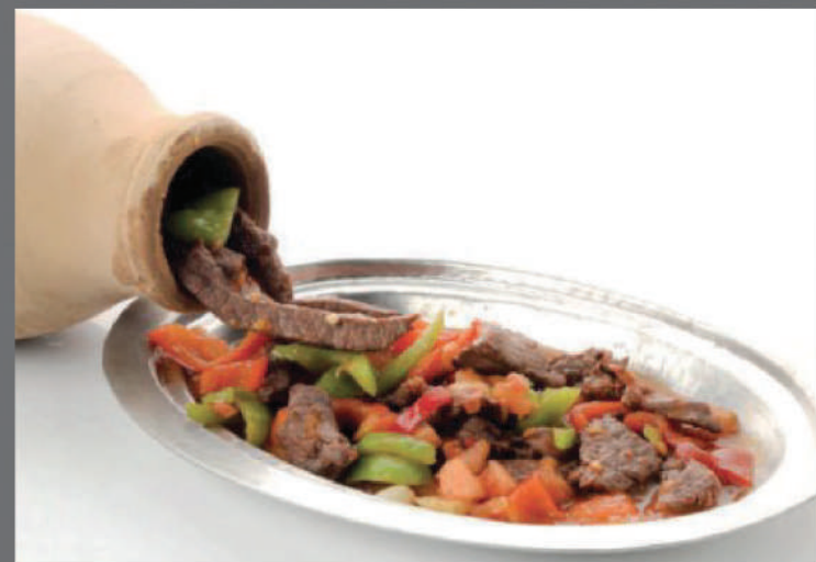
Testi Kebab (for two pax) 1.350 ₺ A local Anatolian folk dish prepared with lamb, Garlic, Red Pepper, Red Pepper, Fresh thyme, and pepper paste.

"Please let us know your dietary requirements and allergies so we can better prepare your meal!" All prices are mentioned in Turkish Lira and include VAT. 10% service fee will be added.